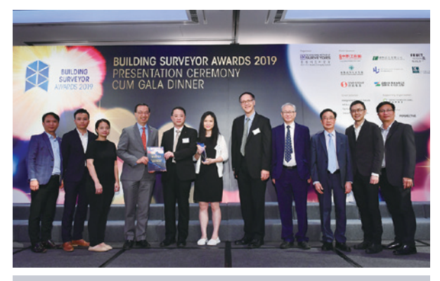
Building Surveyors Awards 2019 (23 July 2019)