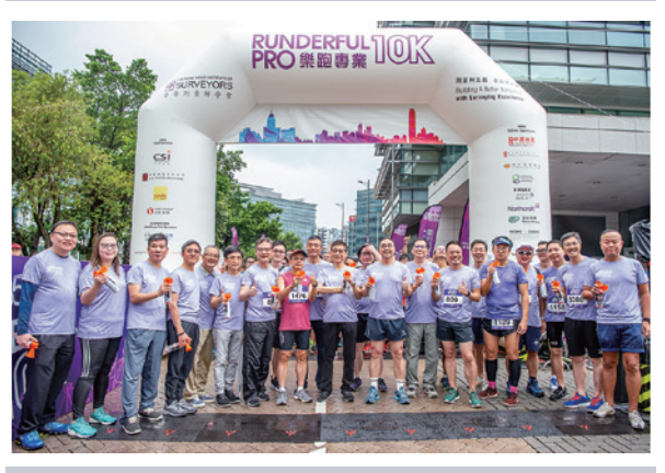
HKIS Runderful Pro (15 Sept 2019)