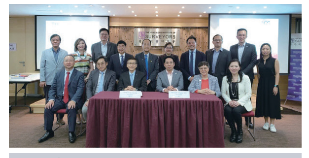
MoU with Smart City Consortium

Taking up the position of Chairman again has been a very delightful challenge. I enjoyed facilitating the integration of young and experienced LSs, and appreciate the council members for their continued contributions in promoting our professional services to the public and the society, and strengthening our networks with both Mainland and international bodies. In this council year, we put forward: (1) mutual recognitions with RICS - Geomatics and CICES - geospatial engineering; (2) close co-operation agreement with Smart City Consortium; (3) focused on community services such as conducting surveys for the non-profit organization Wheel for Oneness 極地同行 and participating dragon boat races in Eastern District and Stanley; (4) provided opportunities for younger members; and (5) carried out the exploration of expanded scopes of services under smart city initiatives. We are obliged to provide all surveyors and probationers with high quality CPD and PQSL sessions to update their knowledge, with which they can share with their counterparts, as well as to uplift the credentials of the LS membership base.