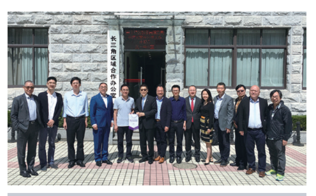
PDD Shanghai Technical Visit