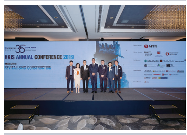
HKIS Annual Conference 2019 (21 Sept 2019)