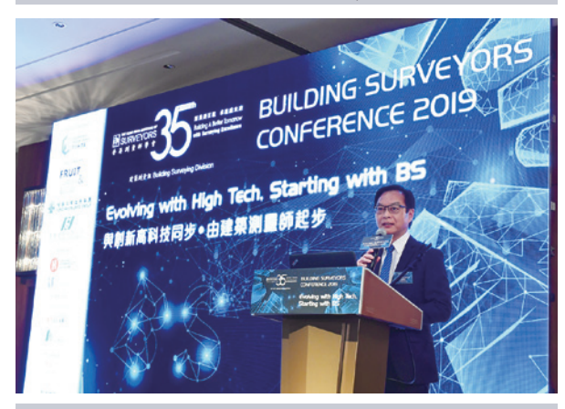
Building Surveyors Conference 2019 (11 Nov 2019)